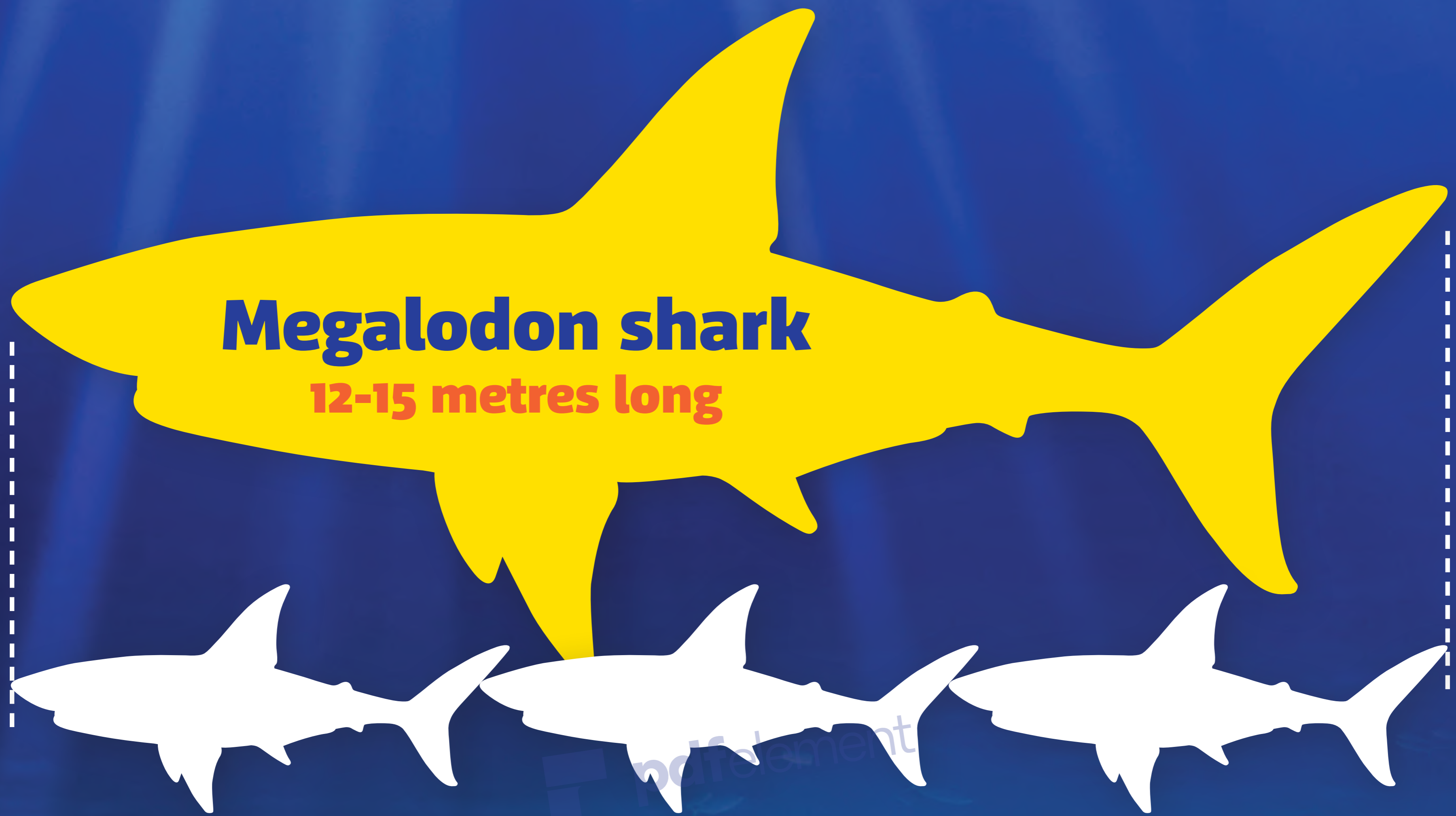
Megalodon shark 12-15 metres long